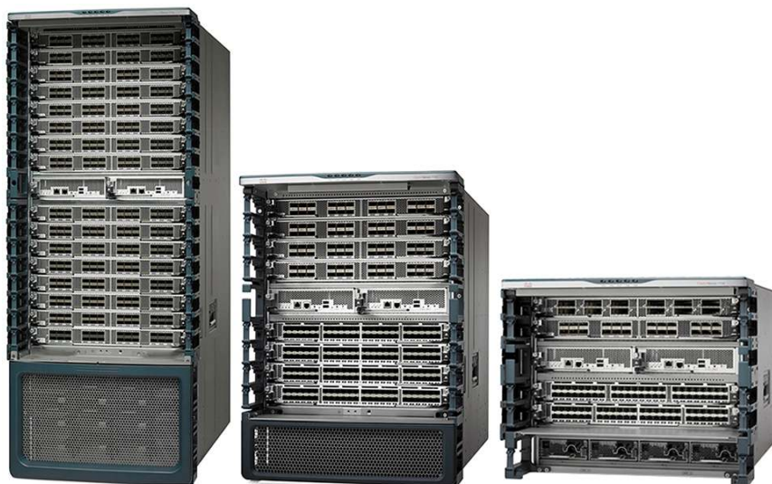
Figure 1. Cisco Nexus 7700 Switches

The Cisco Nexus 7700 switches (Figure 1) have operational and feature consistency with the existing Cisco Nexus 7000 Series Switches, using common system architecture, the same application-specific integrated circuit (ASIC) technology, and the same proven Cisco NX-OS Software releases.