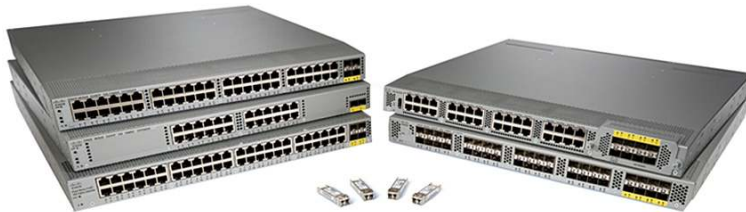
Figure 2. Cisco Nexus 2000 Series Fabric Extenders

The Cisco Nexus 2000 Series Fabric Extenders comprise a category of data center products that provide a server-access platform that scales across a multitude of 1 Gigabit Ethernet, 10 Gigabit Ethernet, unified fabric, rack, and blade server environments. The Cisco Nexus 2000 Series Fabric Extenders are designed to simplify data center architecture and operations by dramatically reducing the points of management and by meeting the business and application needs of a data center. Working in conjunction with Cisco Nexus switches, the Cisco Nexus 2000 Series Fabric Extenders offer a cost-effective and efficient way to support today's Gigabit Ethernet environments while allowing easy migration to 10 Gigabit Ethernet, virtual machine-aware Cisco unified fabric technologies.