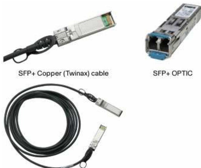
Figure 1. Cisco SFP Transceiver Modules

Figure 1 shows Cisco® SFP transceiver modules.