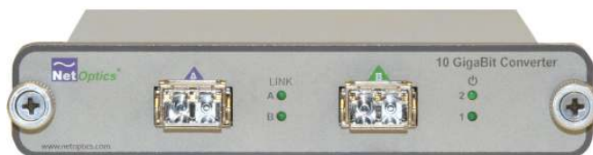
Figure 2. Net Optics Media Converter

The Net Optics® 10 GigaBit Media Converter supports two XFP interfaces, which convert from SR or LR to ER or ZR, supporting connectivity of up to 80 km for site-to-site connection (Figure 2). A media converter provides the benefits of SFP+ for high-density I/O modules while enabling long-distance site-to-site applications for data center and campus interconnection. Media converters are designed to be used to connect dissimilar 10-Gigabit devices, or in pairs at each end of long-distance fiber links.