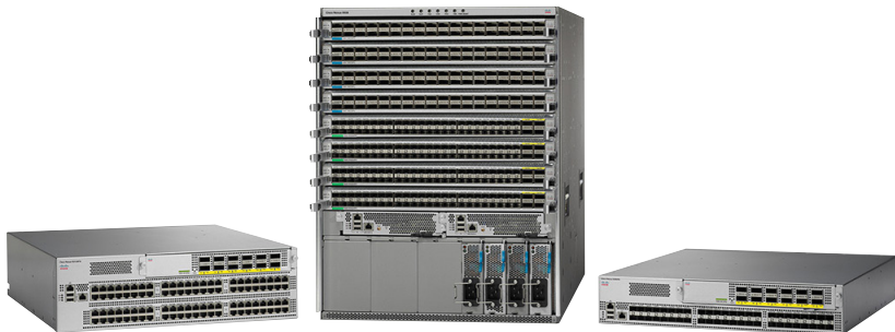
Figure 2. Cisco 9000 Series Switches

The Cisco Nexus 9508 Switch (Figure 2 middle) is a 13-rack unit (13RU) 1, 10, and 40 Gigabit Ethernet modular switch with eight line cards and six fabric module slots. It provides 30 terabits per second (Tbps) Layer 2 and 3 switching performance and up to 288 nonblocking 40 Gigabit Ethernet ports or 1152 nonblocking 10 Gigabit Ethernet ports per fully populated system. The switch has no midplane and hence offers superior airflow and cooling within the chassis and a simple upgrade path for future 100 Gigabit Ethernet modules. The Cisco Nexus 9500 platform is fully redundant, with two supervisors, two system controllers, three fan trays, and up to four power supplies.