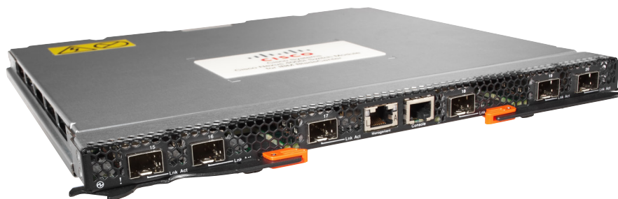
Figure 1. Cisco Nexus 4001l Switch Module for IBM BladeCenter

Cisco Nexus 4000 Series switches are purpose-built to provide the server access foundation required for scale-out virtualized x86 computing architectures built on high-density blade servers. The Cisco Nexus 4000 Series is an all 10-Gbps Fibre Channel over Ethernet (FCoE) switch that is fully compliant with the IEEE 802.1 Data Center Bridging specification. The Cisco Nexus 4000 Series extends the benefits of the Cisco Nexus Family of data center switches to blade servers, the fastest growing segment of the scale-out x86 server market. The Cisco Nexus 4000 Series provides innovative architecture to simplify data center transformation, enabling a standards-based, high-performance Unified Fabric over 10 Gigabit Ethernet in the blade server environment. This Unified Fabric enables consolidation of LAN traffic, storage traffic (IP-based such as iSCSI, network-attached storage [NAS], and Fibre Channel SAN), and high-performance computing (HPC) traffic over a single high-performance, 10 Gigabit Ethernet server access link.