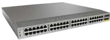
Figure 3. Cisco Nexus N2248TP-E

The Cisco Nexus 2248PQ 10 Gigabit Ethernet Fabric Extender is the newest member of the Cisco Nexus Fabric Extender Family (Figure 4). It supports high-density 10 Gigabit Ethernet environments and has 48 1/10 Gigabit Ethernet SFP+ host ports and 4 QSFP+ fabric ports (16 x 10 GE fabric ports). QSFP+ connectivity simplifies cabling while lowering power and solution cost. The Cisco Nexus 2248PQ 10GE Fabric Extender supports FCoE and a set of network technologies known collectively as Data Center Bridging (DCB) that increase the reliability, efficiency, and scalability of Ethernet networks. These features allow support for multiple traffic classes over a lossless Ethernet fabric, thus enabling consolidation of LAN, storage area network (SAN), and cluster environments.