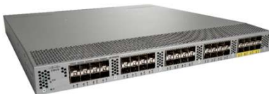
Figure 5. Cisco Nexus N2232PP

The Cisco Nexus 2232TM-E Fabric Extender supports scalable 1/10GBASE-T environments, ease of migration from 1GBASE-T to 10GBASE-T, and effective reuse of existing structured cabling. It comes with an uplink module that supports eight 10 Gigabit Ethernet fabric interfaces. It is a superset of the Cisco Nexus 2232TM with the latest generation of 10GBASE-T PHY, enabling lower power and improved bit error rate (BER). The Cisco Nexus 2232TM-E supports DCB and LAN and SAN consolidation. FCoE support up to 30m distance with Cat6a and Cat7 cables from adapter to FEX. (Figure 6).