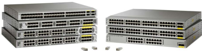
Figure 2. Cisco Nexus 2000 Series Fabric Extenders from Bottom Right to Top Left: Cisco Nexus 224TP GE, 2248TP GE, 2248TP-E GE, 2232TM 10GE, 2232TM-E 10GE, 2232PP 10GE, and 2248PQ 10GE; Cost-Effective Fabric Extender Transceivers for Cisco Nexus 2000 Series and Cisco Nexus Parent Switch Interconnect are in Front of the Fabric Extenders

The Cisco Nexus 2000 Series provides two types of ports: ports for end-host attachment (host interfaces) and uplink ports (fabric interfaces). Fabric interfaces, differentiated with a yellow color, are for connectivity to the upstream parent Cisco Nexus switch.