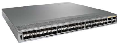
Figure 4. Cisco Nexus N2248PQ

The Cisco Nexus 2232PP 1/10 Gigabit Ethernet Fabric Extender is an ideal platform for migration from Gigabit Ethernet to 10 Gigabit Ethernet and unified fabric environments. It supports FCoE and DCB (Figure 5).