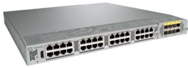
Figure 6. Cisco Nexus N2232TM-E

Cisco Nexus 2000 Series Fabric Extenders connect to a parent Cisco Nexus switch through their fabric links using CX1 copper cable, short-reach or long-reach optics, and the cost-effective Cisco Fabric Extender Transceivers. Cisco Fabric Extender Transceivers are optical transceivers that provide a highly cost-effective solution for connecting the fabric extender to its parent switch over OM3 or OM4 multimode fiber.