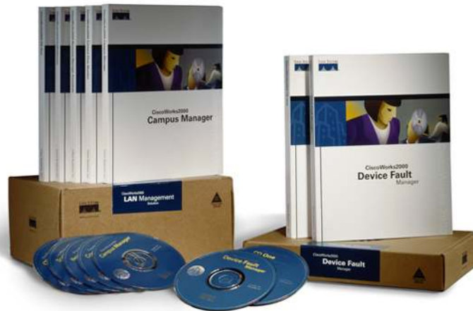
Figure 2. CiscoWorks LAN Management Solution

The Cisco Catalyst Blade Switch 3030 uses CiscoWorks, the same management framework, that controls Cisco products throughout data center and enterprise networks. CiscoWorks LAN Management Solution (Figure 2), the preferred management tool for enterprise switch platforms, can now be used to manage data center networks all the way to the server edge. The added benefits of security, resiliency, manageability, and end-to-end services deployment provide compelling operational and business benefits.