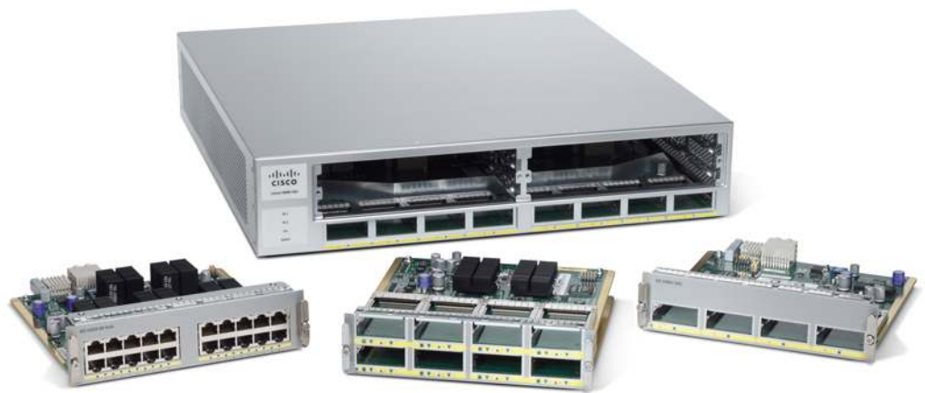
Figure 1. Cisco Catalyst 4900M

The Cisco Catalyst 4900M half cards provide a wide variety of combinations of Gigabit Ethernet and 10 Gigabit Ethernet media types. The base unit can accommodate up to two of following half cards in any combination: