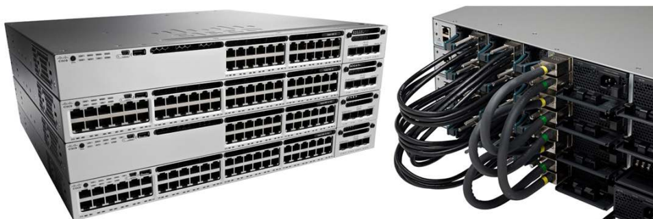
Figure 3. Cisco Catalyst 3850 Series Switches

Table 1 shows the Cisco Catalyst 3850 Series configurations.