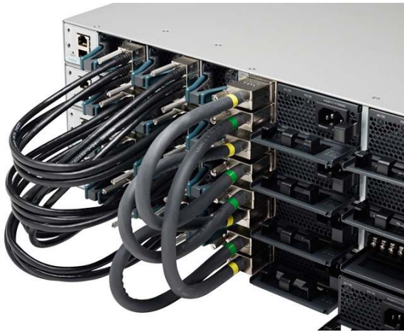
Figure 2. StackWise-480 and StackPower Connectors

StackPower can be deployed in either power-sharing mode or redundancy mode. In power-sharing mode, the power of all the power supplies in the stack is aggregated and distributed among the switches in the stack. In redundant mode, when the total power budget of the stack is calculated, the wattage of the largest power supply is not included. That power is held in reserve and used to maintain power to switches and attached devices when one power supply fails, enabling the network to operate without interruption. Following the failure of one power supply, the StackPower mode becomes power sharing.