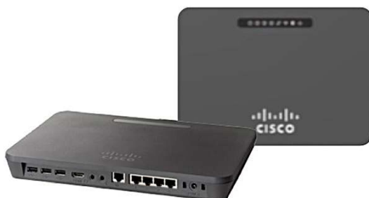
Figure 1. Cisco Edge 300 Series

The Cisco® Edge 300 Series (as shown in Figure 1) is an all-in-one access platform for enterprise next-generation connected room deployments that provide network-connected and rich media-enabled environments. It integrates all the essential components of a digital connected room experience with Ethernet LAN access, wireless LAN access, rich media, and application computing. It is also an open application platform that allows application partners and service providers to customize it to enable vertical solutions. Comparing to the traditional in-room deployments with PCs and multiple access devices, the Cisco Edge 300 significantly lowers the customer total cost of ownership.