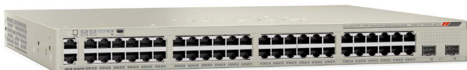
Figure 1. Cisco Catalyst 6800ia Series Switches

Cisco® Catalyst® Instant Access is a solution to dramatically simplify the campus network operations, a game changer for business transformation creating opportunities for innovation in the campus. It simplifies operation through a single point of operation and management for campus access and backbone. The solution is composed of a Cisco Catalyst 6500 or 6800 core switch and Cisco Catalyst 6800ia Series Switches (Figure 1). The Cisco Catalyst 6800ia access switches are connected to the Cisco Catalyst 6500 or 6800, and the entire configuration works as a single extended switch with a single management domain. This allows Catalyst 6500/6800 features to be extended to network access e.g. MPLS/EVN in access. This solution is optimized for wired devices with centralized wireless. The access switches can support Power over Ethernet Plus (PoE+), and the access switches can be stacked together for higher port density and resiliency. IT has flexibility to deploy the Cisco Catalyst Instant Access solution on all or a subset of the campus network. IT can reuse existing network cabling infrastructure to deploy this solution.