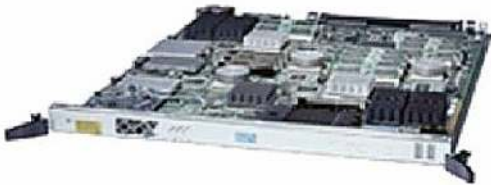
Figure 2. Cisco 12000 Series 16-, 8-, and 4-Port OC-3c/STM-1c POS ISE Line Cards