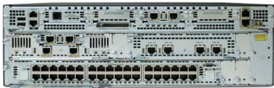
Cisco 3845 Integrated Services Router