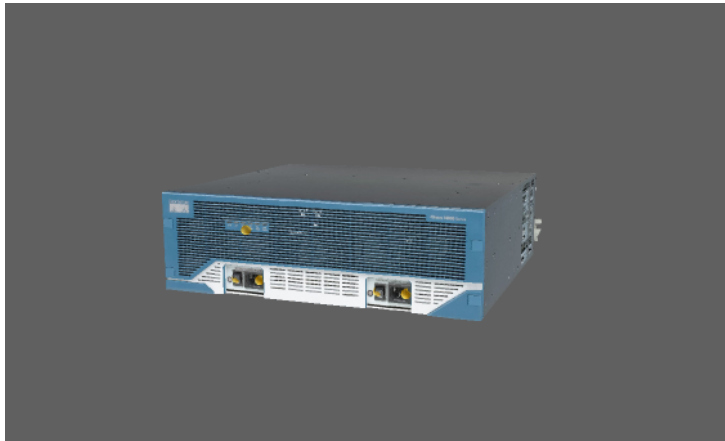
Figure 1. Cisco 3825 and Cisco 3845 Integrated Services Router

Cisco Systems®, Inc. is redefining best-in-class enterprise routing with a new portfolio of Integrated Services Routers optimized for secure, wire-speed delivery of concurrent data, voice, video, and wireless services. Founded on 20 years of innovation, the Cisco® 3800 Series of Integrated Services Routers extends Cisco Systems' leadership in multiservice routing, providing customers with unparalleled network agility, performance, and intelligence. By transparently integrating advanced technologies, adaptive services, and secure enterprise communications into a single, resilient system; the Cisco 3800 Series routers ease deployment and management, lower network cost and complexity, and provide unmatched investment protection. The Cisco 3800 Series routers feature embedded security processing, significant performance and memory enhancements, and new high-density interfaces that deliver the performance, availability, and reliability required for scaling mission-critical security, IP telephony, business video, network analysis, and Web applications in the most demanding enterprise environments. Built for performance, the Cisco 3800 Series routers deliver multiple concurrent services at wire-speed T3/E3 rates.