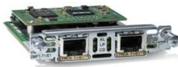
Figure 2. Cisco 2-Port T1/E1 MFT VWIC2 (part number VWIC2-2MFT-T1/E1) with an Optional 64-Channel MFT Dedicated ECAN Module (part number EC-MFT-64)

The Cisco MFT VWIC2 interface cards have an onboard slot for a 32- or 64-channel Cisco MFT Dedicated ECAN Module (part number EC-MFT-32 or EC-MFT-64) (see Figure 2). These optional daughter cards provide a dedicated hardware resource that runs the Cisco Enhanced ITU-T G.168 ECAN feature. The processing and memory resources of the dedicated ECAN module help enable configuration of the echo canceller with predefined settings and an extended 128-ms echo tail buffer, providing a robust echo-cancellation performance for demanding network environments. The 32- and 64-channel configurations of the dedicated ECAN modules match the requirements of the Cisco 1- and 2-port MFT VWIC2 cards, respectively.