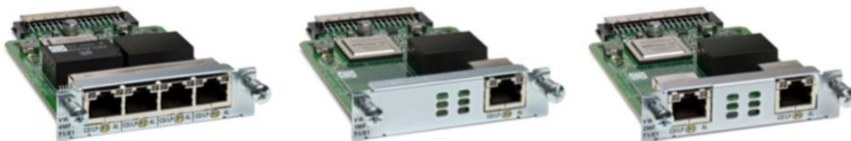
Figure 1. Cisco 1-,2- and 4-Port T1/E1 MFT VWIC3

The Cisco MFT VWIC3 interface cards add improvements over the Cisco Second-generation 1- and 2-port T1/E1 Multiflex Voice/WAN Interface Cards (MFT VWIC2s). The Cisco 2- and 4-port MFT VWIC3s enable each port to be clocked from an independent clock source for data applications. Voice applications can now be clocked independently from data applications, with all ports for voice applications clocked from a single source. The Cisco MFT VWIC3s use the ECAN on the motherboard PVDM cards with up to 128ms echo-tail length for demanding network conditions. MFT VWIC3 cards support up to 2 channel groups per T1/E1 port for serial data applications. Refer to Table 3 for all configuration options offered with the MFT VWIC3 cards.