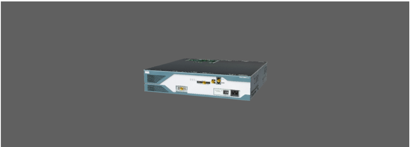
Figure 1. Cisco 2800 Series

Cisco Systems®, Inc. is redefining best-in-class enterprise and small- to- midsize business routing with a new line of integrated services routers that are optimized for the secure, wire-speed delivery of concurrent data, voice, video, and wireless services. Founded on 20 years of leadership and innovation, the Cisco® 2800 Series of integrated services routers (refer to Figure 1) intelligently embed data, security, voice, and wireless services into a single, resilient system for fast, scalable delivery of mission-critical business applications. The unique integrated systems architecture of the Cisco 2800 Series delivers maximum business agility and investment protection.