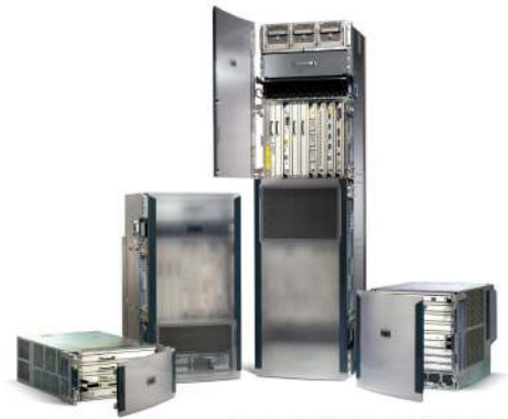
Cisco 12000 Series Routers