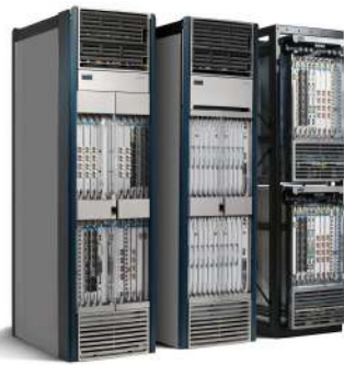
Cisco Carrier Routing System (CRS)