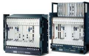
Cisco ONS 15454 Multiservice Transport Platform