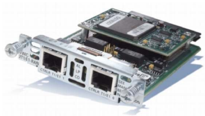
Figure 1. Cisco 2-Port T1/E1 Protection Switching RAN VWIC