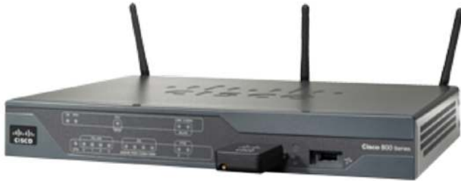
Figure 1. Cisco 880G Series 3G Wireless Integrated Services Routers

With enhanced data rates and improved latency (below 100 milliseconds), WWAN services are an ideal way to supplement traditional wire line services. 3G WWAN data services offered today have average data rates well in excess of ISDN speeds, with theoretical limits in excess of 7 Mbps on the downlink and 5 Mbps on the uplink. The 3G WWAN can be use as a primary link for sites with lower bandwidth requirements and for mobile applications. The 3G WWAN data services can also be use as a cost-effective alternative in areas where broadband services are either not available or very expensive. Cisco is building on these performance milestones and adding support for wireless to our wide variety of WAN interface alternatives.