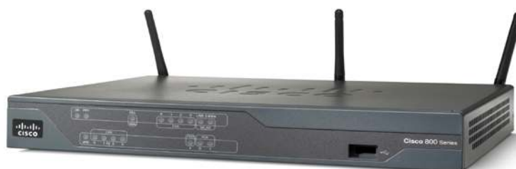
Figure 1. Cisco 861 Integrated Services Router with Integrated 802.11n Access Point