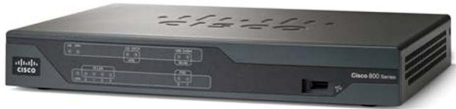
Table 1. Cisco 880VA Series Data Models