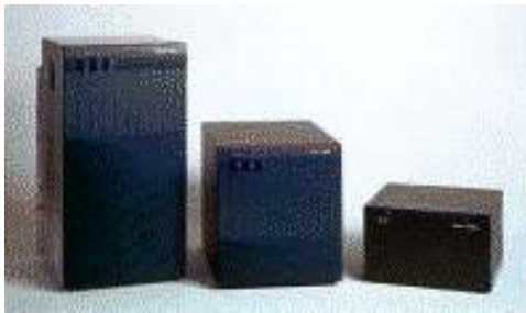
Figure 1. Cisco 7500 Series Router

The Cisco® 7500 Series router is the premier Cisco distributed services, multiprotocol platform, now with twice the performance and enhanced high-availability (HA) features. The Cisco 7500 Series combines proven Cisco software technology with exceptional reliability, availability, serviceability, and performance features to meet the requirements of today's most mission-critical networks. The Cisco 7500 Series router provides service provider and enterprise networks with the flexibility they need to meet the constantly changing requirements of their networks. The three models of the Cisco 7500 Series allow users to choose the exact configuration needed to optimize installations and network designs for cost and functionality.