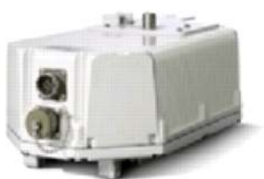
Figure 2. Cisco Aironet 1500 Series

For additional information about the Cisco Aironet 1500 Series lightweight outdoor mesh access points, visit http://www.cisco.com/en/US/products/ps6548/index.html .