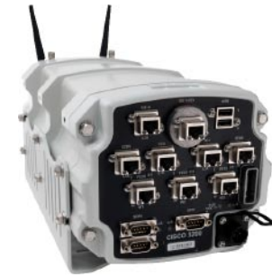
Figure 1 Cisco 3200 Series Rugged Integrated Services Router

Cisco 3200 Series Rugged Integrated Services Routers use standards-based mobile IP features in Cisco IOS Software to allow the mobile node to stay connected as it moves from one wireless network to another. Transition to different wireless networks is transparent to the users and devices (such as laptops, personal digital assistants [PDAs], and surveillance cameras) connected to the vehicle network. These devices and applications maintain continuous connectivity over multiple wireless networks without user intervention. In essence, the Cisco 3200 Series allows an entire mobile network or subnet to stay connected while in motion. Figure 2 shows how a vehicle network roams between different wireless networks while maintaining a transparent connection to network resources.