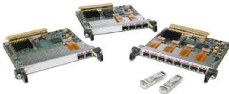
Figure 1. Cisco 2/4/8-Port OC-12 POS SPAs with SFP Optics

The Cisco® I-Flex design combines shared port adapters (SPAs) and SPA interface processors (SIPs), using an extensible design that enables service prioritization for voice, video, and data services. Enterprise and service provider customers can use the improved slot economics resulting from modular port adapters that are interchangeable across Cisco routing platforms. The I-Flex design maximizes connectivity options and offers superior service intelligence through programmable interface processors, which deliver line-rate performance. I-Flex enhances speed-to-service revenue and provides a rich set of quality-of-service (QoS) features for premium service delivery while effectively reducing the overall cost of ownership. This data sheet contains the specifications for the Cisco 2/4/8-Port OC-12c/STM-4 Packet over SONET SPAs (Cisco 2/4/8-Port OC-12 PoS SPAs; refer to Figure 1).