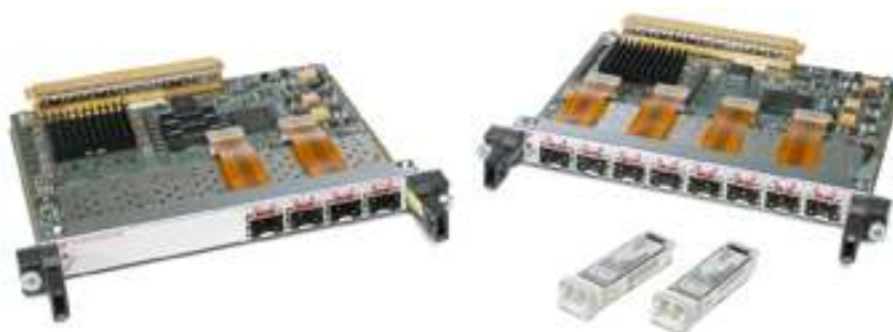
Figure 1. Cisco 4-Port and 8-Port OC-3c/STM-1 POS SPAs

The Cisco® I-Flex design combines shared port adapters (SPAs) and SPA interface processors (SIPs), using an extensible design that enables service prioritization for voice, video, and data services. Enterprise and service provider customers can use improved slot economics resulting from modular port adapters that are interchangeable across Cisco routing platforms. The I-Flex design maximizes connectivity options and offers superior service intelligence through programmable interface processors, which deliver line-rate performance. I-Flex enhances speed-to-service revenue and provides a rich set of quality-of-service (QoS) features for premium service delivery while effectively reducing the overall cost of ownership. This data sheet contains the specifications for the Cisco 4/8-Port OC-3c/STM-1 Packet over SONET SPAs (Cisco 4/8-Port OC-3 POS SPAs; refer to Figure 1).