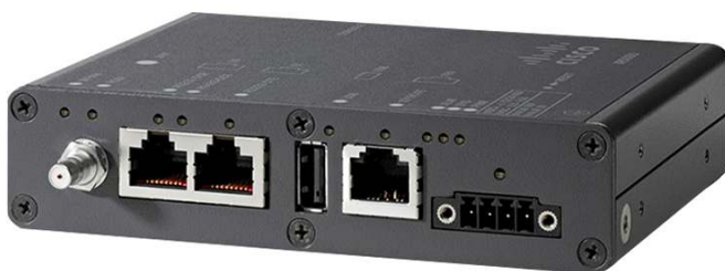
Figure 1. Cisco IR500

Figure 1 displays a Cisco WPAN Industrial Router.