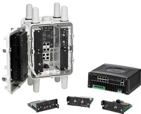
Figure 1. Cisco 1000 Series Connected Grid Routers

The Cisco CGR 1000 Series includes two platforms, shown in Figure 1: The Cisco 1120 Connected Grid Router (CGR 1120), which is designed for indoor deployments; and the Cisco 1240 Connected Grid Router (CGR 1240), which is a weatherproof router in a NEMA Type 4 enclosure for outdoor deployments.