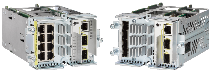
Figure 1. Cisco 2010 Connected Grid Router Ethernet Switch Modules (CGR 2010 ESM)

The Cisco Ethernet Switch Module (CGR 2010 ESM) (Figure 1) greatly expands the Cisco 2010 Connected Grid Router's capabilities by integrating industry-leading Layer 2 and Layer 3 (optional) switching with feature sets comparable to those found in the Cisco 2520 Connected Grid Switches ( http://www.cisco.com/go/cgs2500 ). The new Cisco Ethernet Switch Module along with the Cisco 2010 Connected Grid Router (CGR 2010) are designed specifically for use in connected energy applications such as grid automation, distributed generation, integrated renewable energy, trackside substations, and water, oil, and gas applications. The CGR 2010 ESM uses Cisco IOS® Software, which is the operating system powering millions of Cisco switches worldwide, and provides the benefits of improved security, network resiliency and reliability, and scalability.