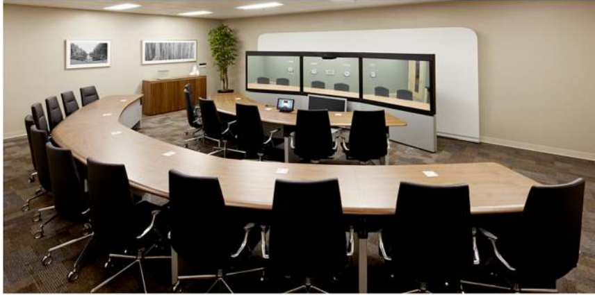
Figure 3. Two Light Reflector Options for the Cisco TelePresence TX9000 - Wall Mounted and Free Standing