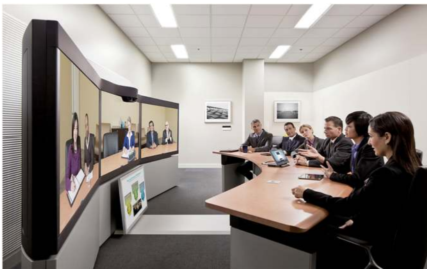
Figure 1. Cisco TelePresence TX9000 One-Row System

The Cisco TelePresence TX9000 Series features two products: the one-row TX9000 seats up to six participants and the two-row TX9200 seats up to 18 participants. The TX9000 Series combines life-size, high-definition (HD) video, content sharing, spatial audio, and an advanced touch user interface, all integrated into a specially-designed room environment for the ultimate immersive experience.