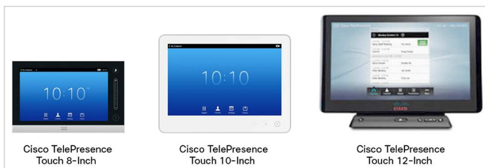
Figure 1. Cisco TelePresence Touch

Cisco TelePresence Touch devices feature a revolutionary user interface focused on people and how they communicate in one-on-one and group settings. Work environments today demand interactions that are distributed across communication mediums and vary with the changing context, contacts, and content. With Cisco TelePresence Touch devices, you can quickly and easily access the most common tasks in the context of your interaction. The innovative design allows effortless integration with the various forms of synchronous and asynchronous communication that are already part of the workflow.