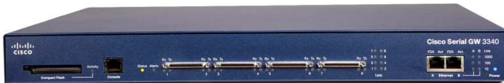
Figure 1. Cisco TelePresence Serial GW 3340

The Cisco TelePresence ® Serial GW 3340 is part of the industry-leading Cisco TelePresence videoconferencing solution. It allows transparent integration between IP and serial videoconferencing networks (Figure 1). A easy to configure appliance with feature transparency plus powerful dial-plan capabilities, it allows organizations using networks attached through serial interfaces to gain all the benefits from IP-based high-definition (HD) videoconferencing solutions.