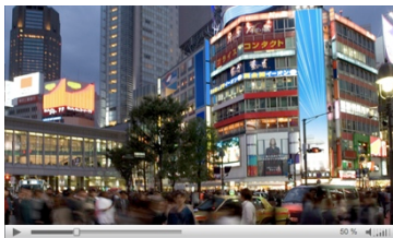
Watch High-Resolution video