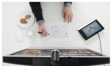
Share Content with a Document Camera