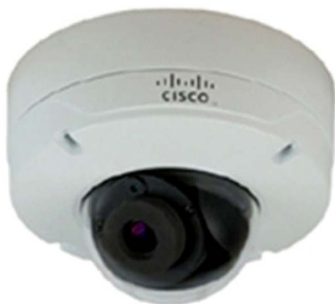
Figure 1. Cisco Video Surveillance 3530 IP Camera

The Cisco Video Surveillance 3530 IP Camera offers a variety of benefits, including: