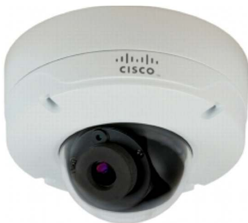
Figure 1. Cisco Video Surveillance 6030 IP Camera

The Cisco Video Surveillance 6030 IP Camera offers a variety of benefits, including: