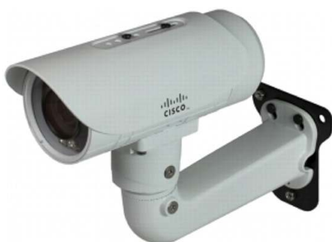
Figure 1. Cisco Video Surveillance 6400 IP Camera

The Cisco Video Surveillance 6400 IP Camera offers a variety of benefits, including: