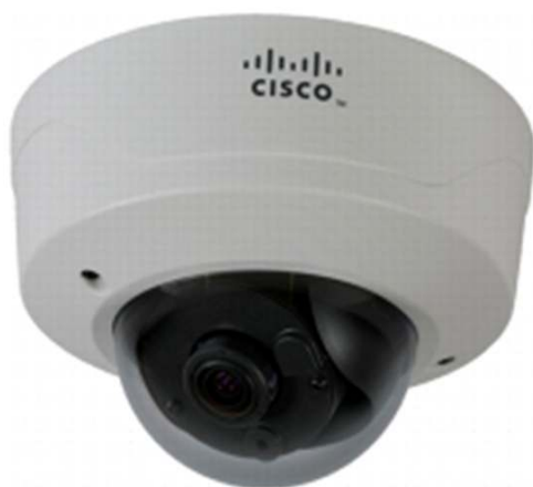
Figure 1. Cisco Video Surveillance 6020 IP Camera

The Cisco Video Surveillance 6020 IP Camera offers a variety of benefits, including: