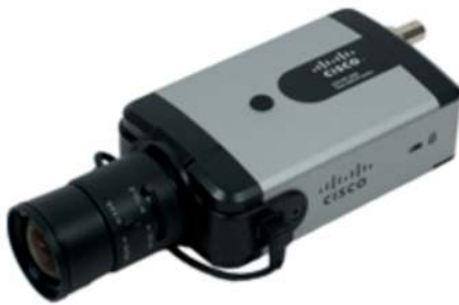
Figure 1. Cisco 2600 IP Camera Shown with Optional DC Auto Iris Lens

The Cisco Video Surveillance 2600 IP Camera offers a variety of benefits, including: