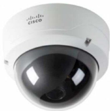
Figure 1. Cisco Video Surveillance 2630V IP Dome

The Cisco Video Surveillance 2630V IP Dome offers a variety of benefits, including: