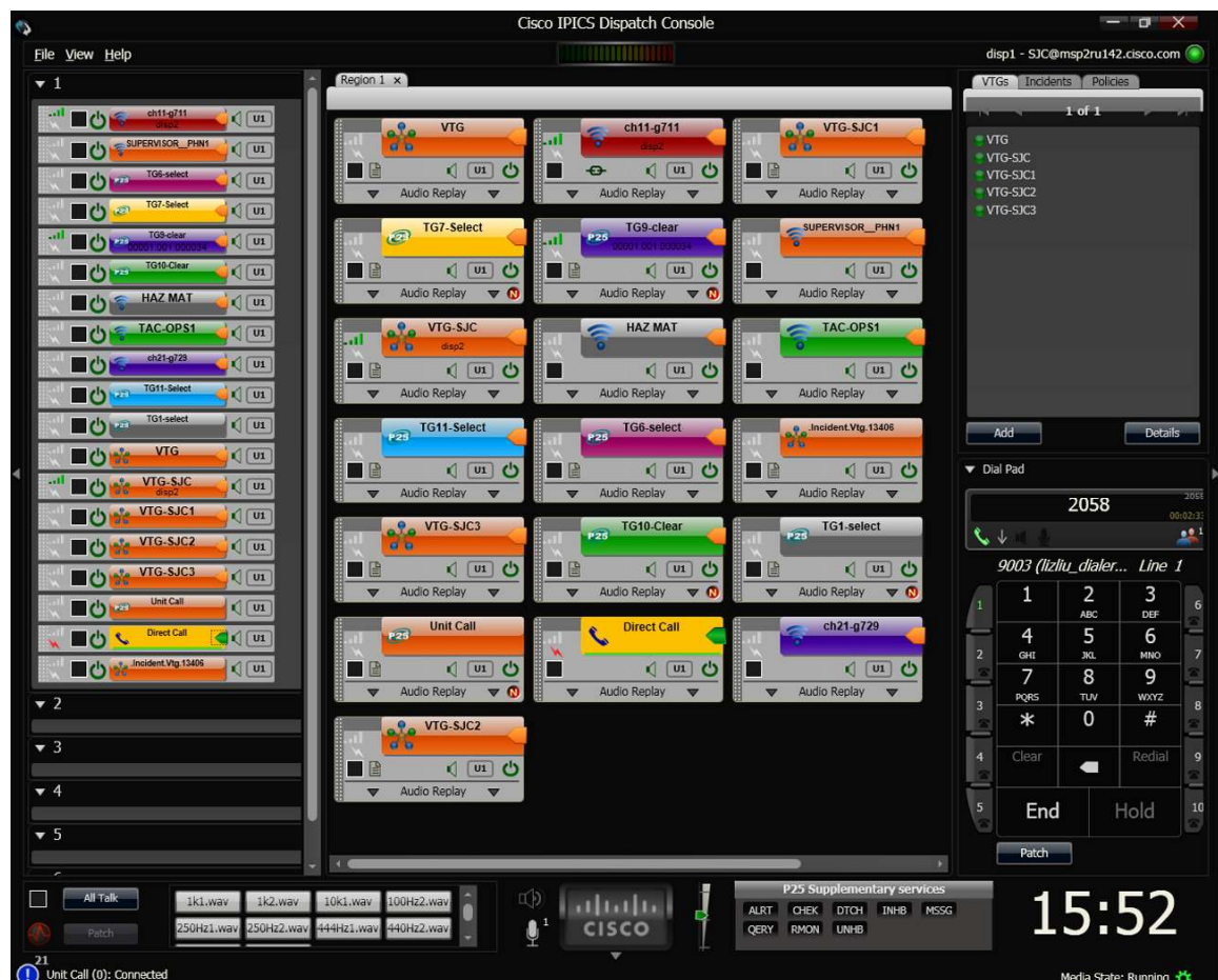
Figure 1. Cisco IPICS Dispatch Console