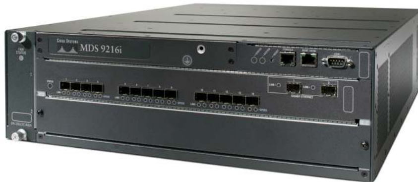
Figure 1. Cisco MDS 9216i Multilayer Fabric Switch

This high level of integration gives Cisco MDS 9216i users the benefits of a multiprotocol system without sacrificing Fibre Channel port density. The expansion slot on the Cisco MDS 9216i allows for the addition of any Cisco MDS 9000 Family switching module, so users can add additional Fibre Channel ports and/or additional IP ports. Alternatively, the expansion slot can be used for a variety of Cisco MDS 9000 Family services modules, thereby providing an unparalleled level of storage services in a single, highly available 3-rack unit (RU) system.