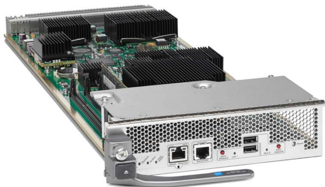
Figure 1. Cisco MDS 9700 Series Supervisor-1 Module

This powerful combination helps organizations build highly available, scalable storage networks with comprehensive security and unified management. The Cisco MDS 9700 Series Supervisor-1 Module is supported in the Cisco MDS 9710 Multilayer Director. Figure 1 shows the Cisco MDS 9700 Series Supervisor-1 Module.