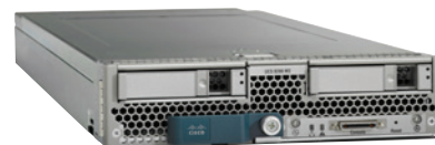
Figure 3. Cisco UCS B200 M3 Server

With innovations including dual 10-Gbps unified fabrics, the Intel Xeon processor E5 family, built-in Cisco VICs, Cisco Data Center VM-FEX, large memory capacity, and Violin's all-solid-state memory, Cisco's results demonstrate the architectural advantages of a system built for