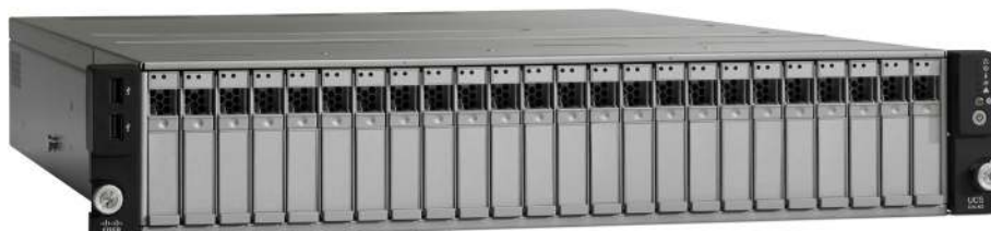
Figure 1. Cisco UCS C24 M3 Server

The Cisco UCS C24 M3 server interfaces with Cisco UCS using another Cisco® innovation: the Cisco UCS Virtual Interface Card 1225. The Cisco UCS Virtual Interface Card 1225 is a virtualization-optimized Fibre Channel over Ethernet (FCoE) PCIe 2.0 x8 10-Gbps adapter designed for use with Cisco UCS C-Series Rack Servers. The Virtual Interface Card 1225 is a dual-port 10 Gigabit Ethernet PCIe adapter that can support up to 18 PCIe standards-compliant virtual interfaces, which can be dynamically configured so that both their interface type (network interface card [NIC] or host bus adapter [HBA]) and identity (MAC address and worldwide name [WWN]) are established using just-in-time provisioning. In addition, the Cisco UCS VIC 1225 can support network interface virtualization and Cisco Data Center Virtual Machine Fabric Extender (VM-FEX) technology.