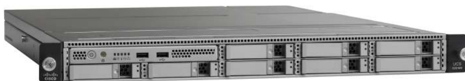
Figure 1. Cisco UCS C22 M3 Server

The Cisco UCS C22 M3 server interfaces with Cisco UCS using another unique Cisco® innovation: the Cisco UCS Virtual Interface Card 1225 (VIC 1225). The Cisco UCS VIC 1225 is a virtualization-optimized Fibre Channel over Ethernet (FCoE) PCIe 2.0 x8 10-Gbps adapter designed for use with Cisco UCS C-Series servers. The VIC is a dual-port 10 Gigabit Ethernet PCIe adapter that can support up to 256 PCIe standards-compliant virtual interfaces, which can be dynamically configured so that both their interface type (network interface card [NIC] or host bus adapter [HBA]) and identity (MAC address and worldwide name [WWN]) are established using just-in-time provisioning. In addition, the Cisco UCS VIC 1225 can support network interface virtualization and Cisco Data Center Virtual Machine Fabric Extender (VM-FEX) technology.