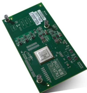
Figure 1. Cisco UCS CNA M72KR-Q QLogic Converged Network Adapter

Designed specifically for the Cisco UCS blades, the adapter provides high-performance connectivity for SAN and LAN traffic. One Cisco UCS M72KR-Q can do the work of a discrete Fibre Channel host bus adapter (HBA) and Ethernet network interface card (NIC). This convergence means fewer cables, fewer switches, less power consumption, reduced cooling, and unified LAN and SAN management.