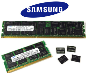
Figure 4. Samsung 40-nm 1.35V High-Efficiency Green DDR3 Memory