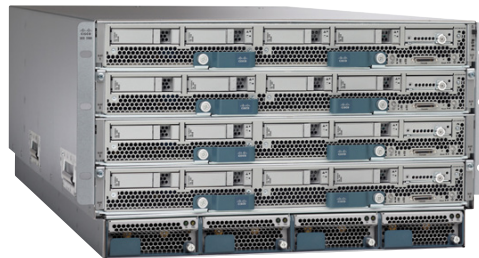
Figure 5. Cisco UCS B440 M2 Blade Servers Installed in Cisco UCS 5108 Blade Server Chassis

The Cisco UCS 5108 chassis accepts between one and four 92 percent-efficient, 2500W hot-swappable power supplies that can be configured in a nonredundant, N+1 redundant,