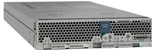
Figure 1. Cisco UCS B230 M2 Blade Server

Cisco continues its commitment to being a trusted x86 systems provider with a wide range of system options. The Cisco UCS B230 M2 further extends the capabilities of the Cisco Unified Computing System by delivering new levels of performance, energy efficiency and reliability for mission-critical applications in a virtualized environment.