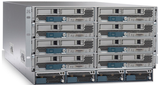
Figure 4. Cisco UCS B230 M2 Blade Servers Installed in Cisco UCS 5108 Blade Server Chassis

The Cisco UCS 5108 chassis accepts between one and four 92 percent-efficient, 2500W hot-swappable power supplies that can be configured in a nonredundant, N+1 redundant, or grid-redundant design. Designed for efficiency at low utilization levels, the chassis power configuration provides sufficient headroom to support blade servers hosting processors using up to 130W each.