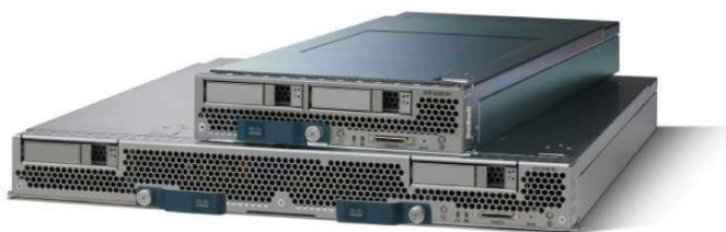
Figure 2. Cisco UCS B200 M2 and UCS B250 M2 Blade Servers

Table 1 compares the features of the Cisco UCS B-Series Blade Servers.